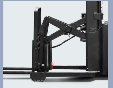
Forks move forward by the scissor structure