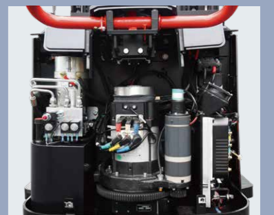
Back cover can be opened fully